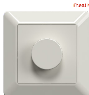
White RAL 9010