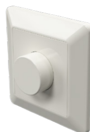
1x White RAL 9010 plastic kit